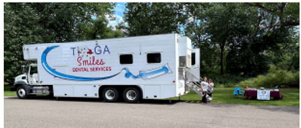
Tioga County Public Health staff set up the Tioga Smiles dental van for visits

Serving Tioga County residents for over 20 years, the Tioga Smiles van functions as a school-based and dental clinic. The staff provide cleanings, X-rays, sealants, fillings, extractions, and fluoride treatments to children and adults. The van removes a major barrier to oral health access in this rural region by bringing oral health care to the community.