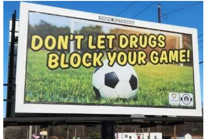
Billboard: Various Locations, March 2026