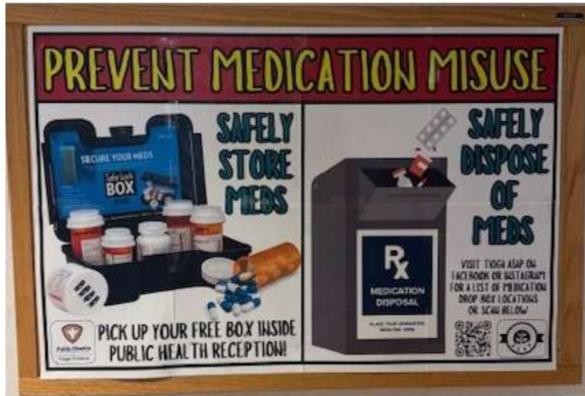
Bulletin Board: Health & Human Services Building, Owego, NY, March 2026.